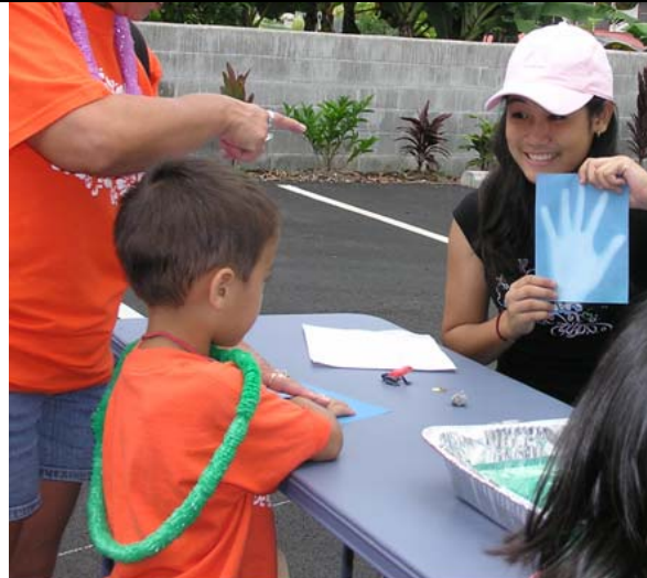
Here's your sun print!