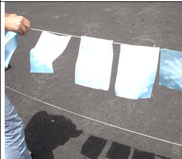
Hang to dry.